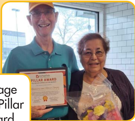
DuPage Pads Pillar Award

Each year, past St. Isidore CCW Women of the Year come together to recognize a member who has generously dedicated her time and talents. continued inside