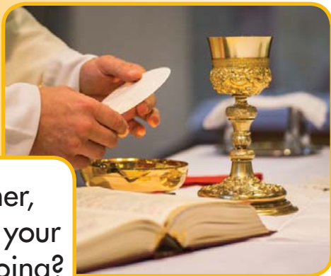
Father, how's your day going?

During National Volunteer Appreciation Week, a celebratory day was held at DuPage Pads with the annual Volunteer Appreciation Luncheon. continued inside