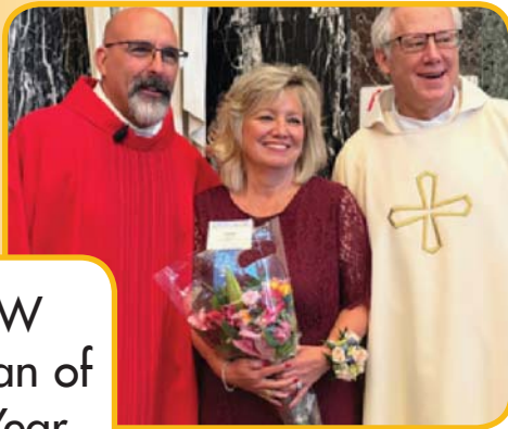
CCW Woman of the Year

A publication of St. Isidore Church for all registered parishioners, so that they may share in the vitality of our faith community stisidoreparish.org